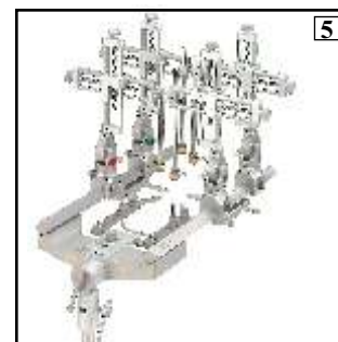
Current Model 1500 Series Kopf Stereotaxic