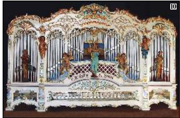
The Mighty Ruth fairground organ after its full restoration in 2003