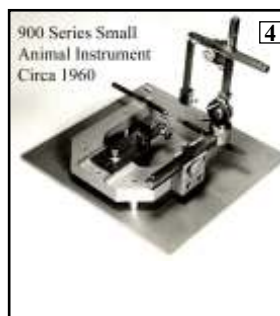
A very early 900 Series Kopf Stereotaxic