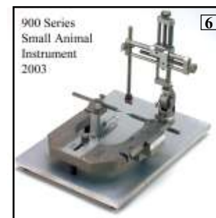
The current 900 Series Kopf Stereotaxic