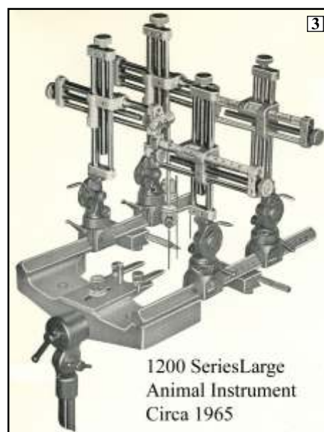
A very early 1200 Series Kopf Stereotaxic

The first machines were very similar to the 1200 series unit seen in the next picture (Picture 3).