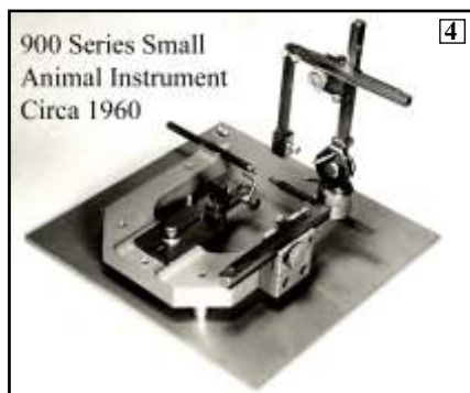
A very early 900 Series Kopf Stereotaxic

The next design was a smaller unit that could easily be used with rats, mice and other small animals, yet was compatible with the adaptors and electrode carriers used in the first units. In about 1960, Kopf introduced the now famous "900 series" units.