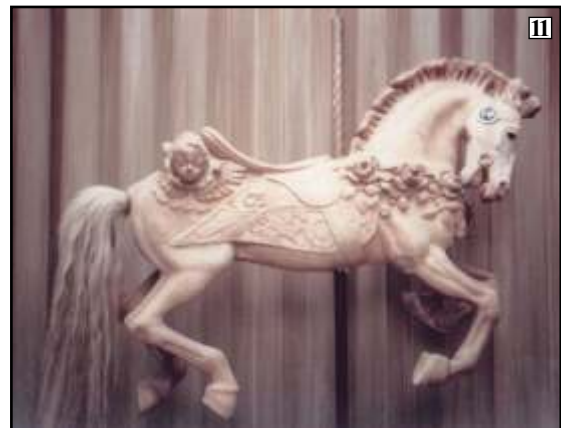
Full sized Carousel Horse "Rosie"