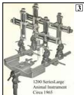
Model 1200 Series Stereotaxic Circa 1965

Thus, while the basic designs of the two major lines have remained constant, the functional details and stability of the machines have been enhanced over the past 35 years. This has allowed the practicing neuroscientist to use the line without major relearning for over 45 years.