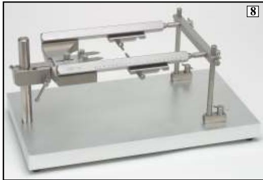
Model 1730 Intracellular Frame Assembly

production of the ultra stable intracellular unit (1700 series, Picture 8) to the large animal line, and a similar 900 series device (not shown). These units, along with similarly upgraded electrode carriers, added the necessary weight and frame strength to give sufficient stability for intracellular recording.