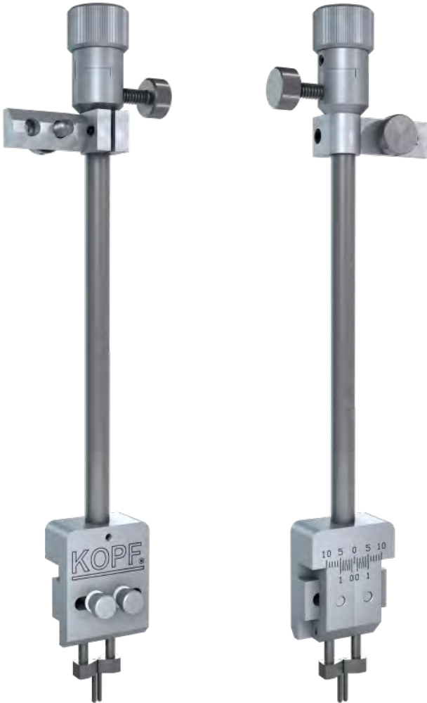
Model 905 Stereotaxic Alignment Indicator